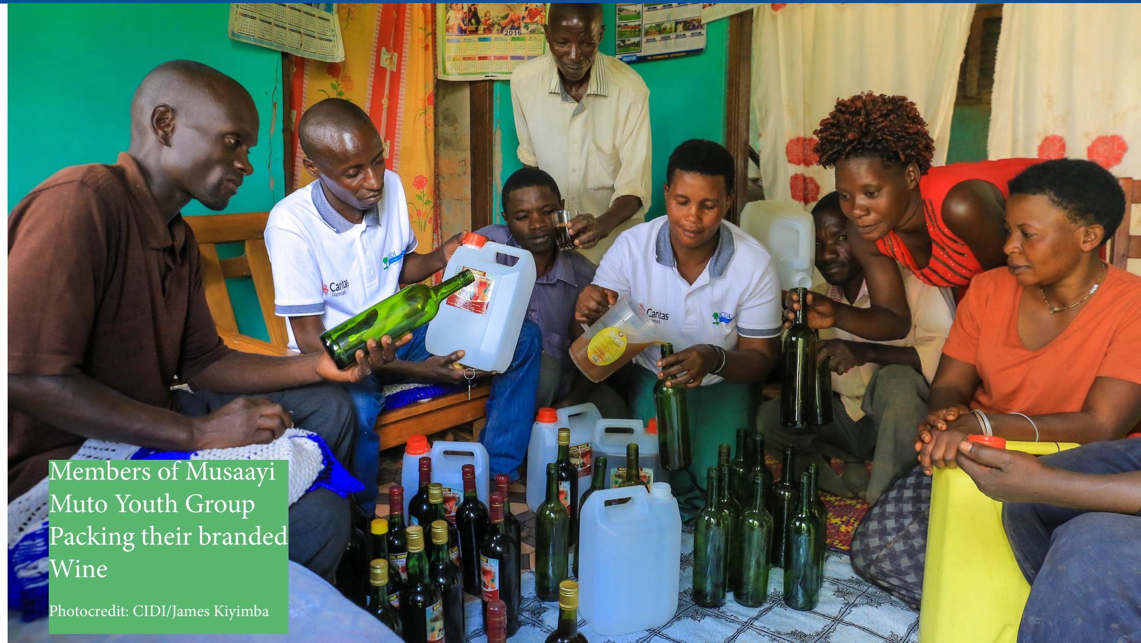
Members of Musaayi Muto Youth Group Packing their branded Wine