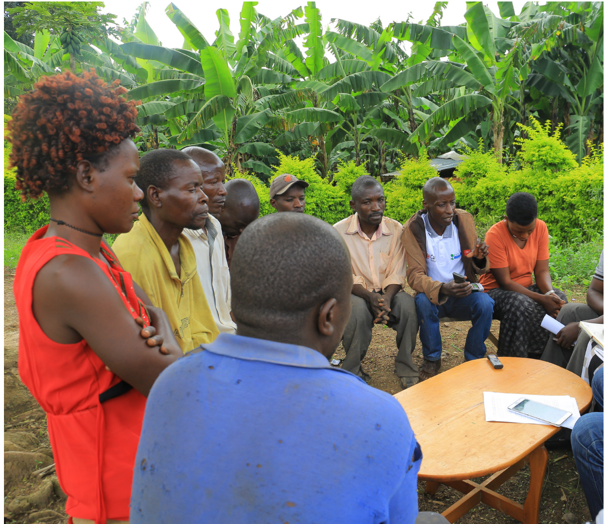
Members of Musaayi Muto Youth group attending a meeting:

When CIDI through the CESL-Youth component started interesting youths to engage in farming, one of the challenges highlighted as hindering their progress in agriculture was limited access to financial support from bigger financial institutions including banks. The youths found it very difficult to access loans due to the unfriendly terms and conditions for loan access and also travelling long distances to Kyotera town (30 kilometres away) to access loans and saving services. For example, the banks needed security for the loans like land, vehicles