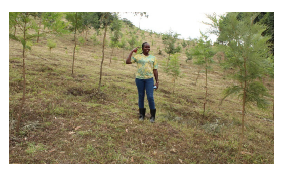
CIDI staff monitoring the tree plantations supported to cooperative farmers in Lwanda S/C Rakai District