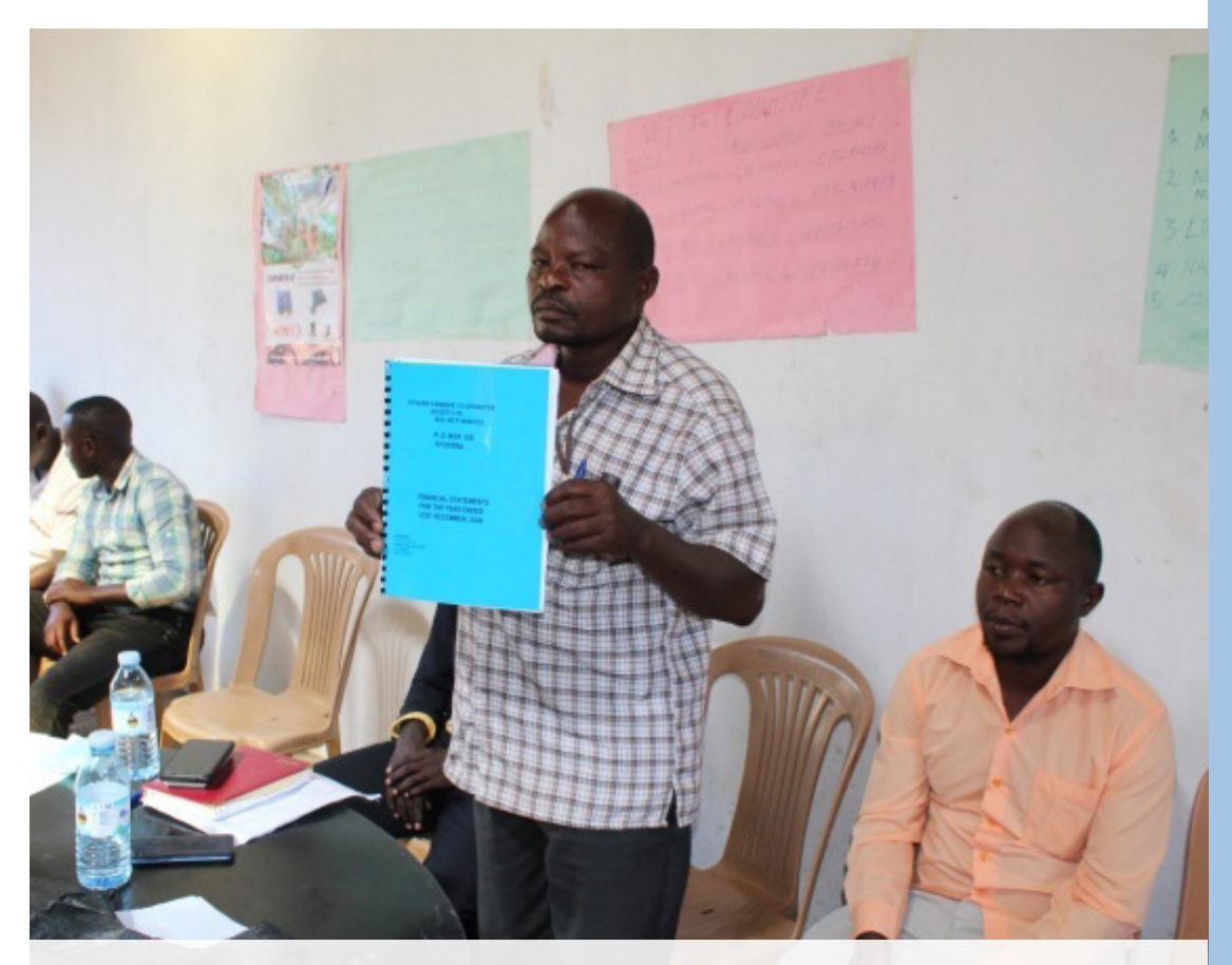
The auditor presenting the 2020 Audit report during Kitasiba Coop AGM held in March 2021

following the procurement guidelines as indicated in cooperative procurement policy. This made auditing of the cooperative very hard because, the auditor lacked access to the supporting financial documents, he lacked evidences for expenditures, some procurement was made without receipts, and money was spent without cash requisitions and acknowledgements.