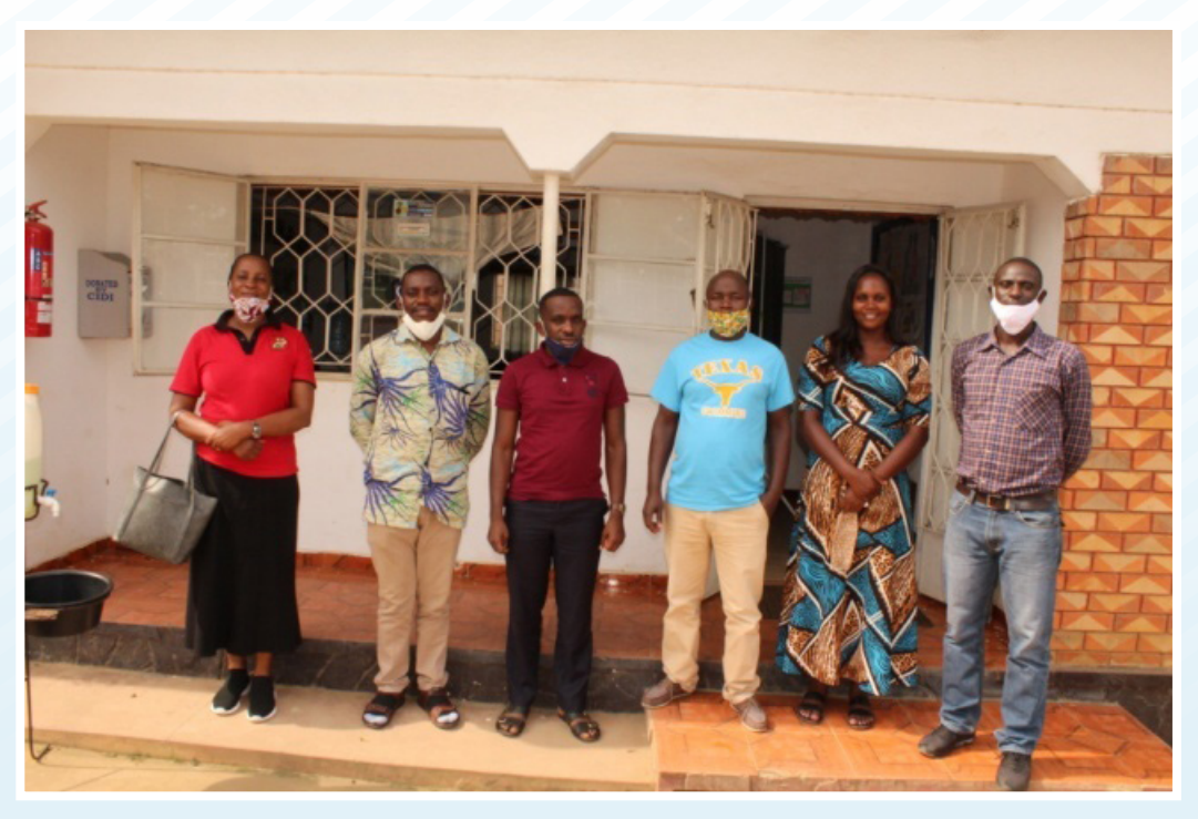
CIDI Rakai Branch staff with UGOPAP Coordination Office Team during technical support visit in Sept 2020