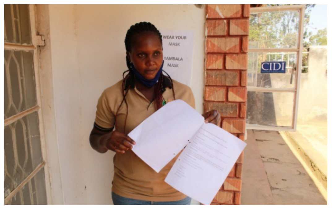
CIDI extension staff displaying a two paged audit report which was produced in 2017 for Kitasiba Farmers Cooperative before financial mentorship intervention was provided.