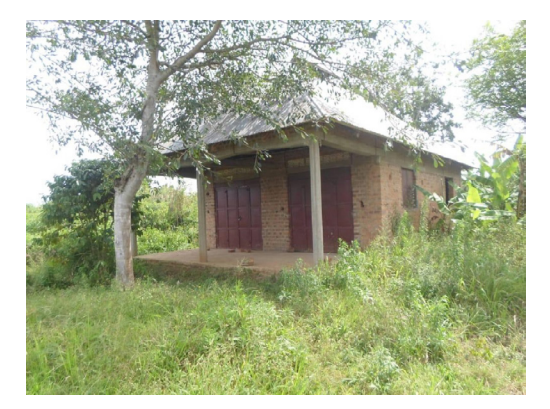
Kitasiba cooperative maize store in 2017 before upgrade using ACDP funding