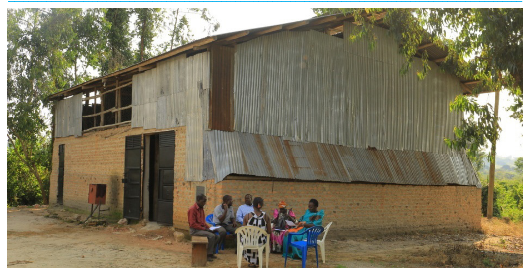
Cooperative leaders during an executive meeting at the Lwanda Coffee factory premises before its was up graded with better structures. (Picture was taken in June 2017

Basing how we used the ACDP funds in 2020 to do coffee business and how we benefited, we have clearly realized that; all our cooperatives need reasonable financial boosts as capitalization fund. As leaders we are not seating back we are strategizing;