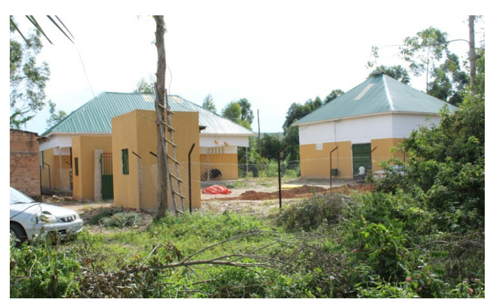
The current Lwanda farmers Coffee Factory structures which include; coffee husk chamber, an office block, a produce store, Askri shelter, kiosk, an improved pit latrine, and a huller shelter.

This has been a good learning to us the leaders and ordinary members of Lwanda Cooperative Society that: if the cooperative is able to access capitalization fund from various sources in sizable amount. they would be able to do meaningful coffee bulking and collective marketing business. This would ably sustain all our farmers cooperative under UGOPAP. With the experience of the 20,000,000ugx from CIDI in 2016 as revolving seed capital fund against