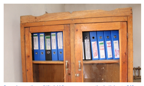
Records practices of Kitaiski farmers cooperative in Kakuuto S/C - Kyotera District