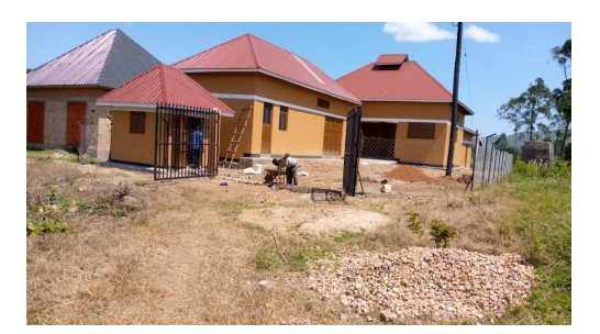
Current Kasasa Cooperative Factory, with equipped offices, Produce store, Coffee huller shelter, Askari shelter and Kiosk (Picture taken in June 2021)