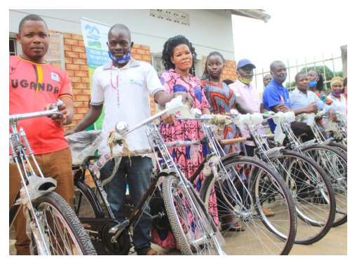
Farmer leaders receive bicycles for field movements. Dec. 2020