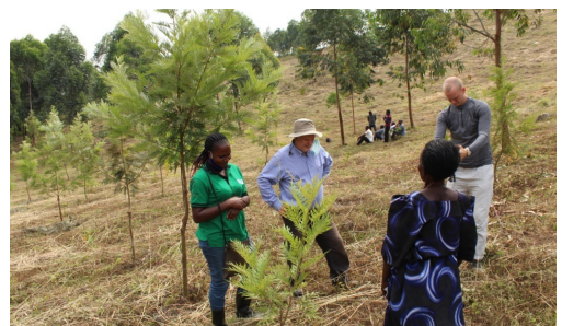
Tree plantation host sharing her experiences in tree management practices