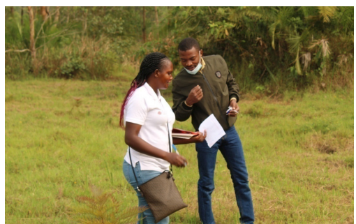
CIDI extension staff during field monitoring