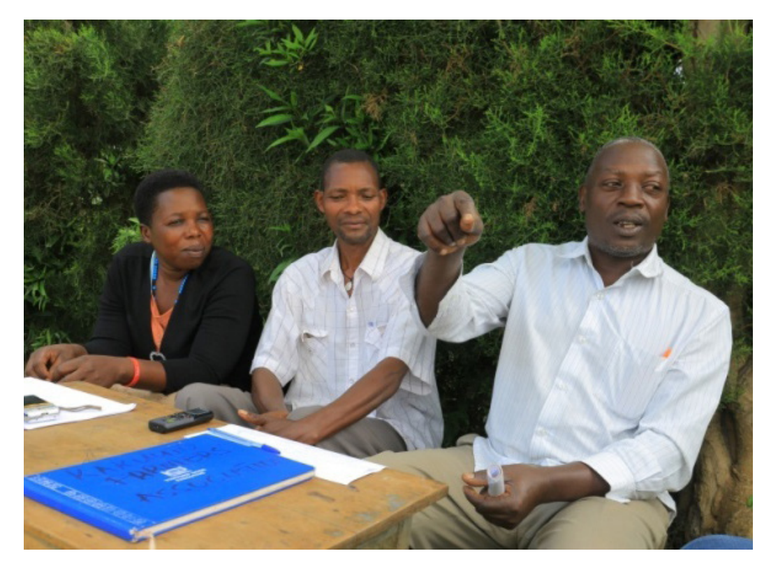
Kitasiba Coop. Leaders during one of the executive meetings in 2019