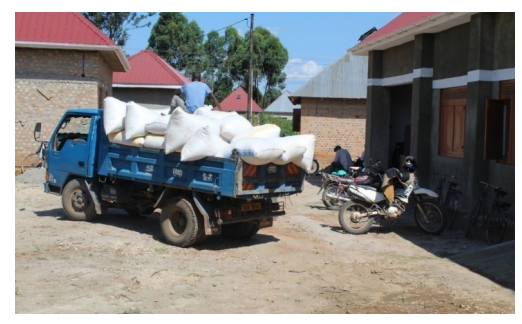
Farmers bulking their coffee for collective marketing of Kitasiba Cooperative. June 2021