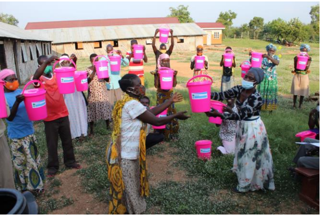
Munguci and Eyete group members receiving buckets to be used for mixing organic pesticides and fertilizers