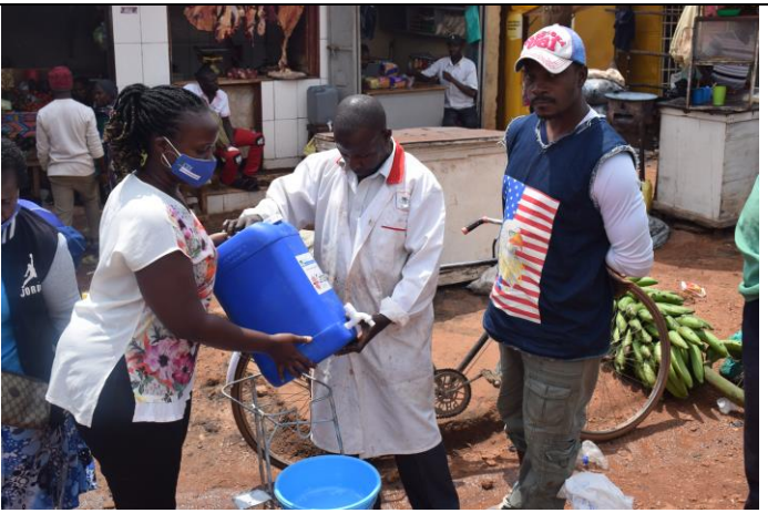
Distribution of hand washing facilities in Kibuye ward 1