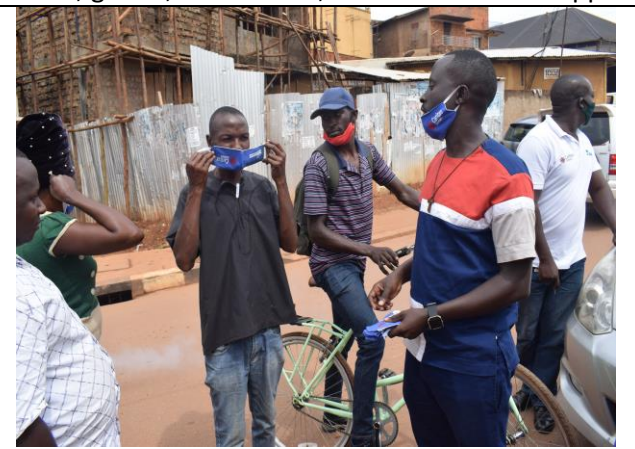
Distribution of face masks in Kibuye communities as a protective gear against COVID19

In partnership with Caritas Denmark, CIDI has in 2020 had a covid19 response project implemented in Kampala city slum communities. The project focused to creating awareness on and prevention of the spread of COVID19 among 4,000 households (10,675 Women and 6,825 Men) in Kibuye 1 Ward, Makindye Division in Kampala. Communities were sensitized on spread, management and prevention of COVID 19. Several IEC materials were produced and distributed and so were radio talk shows were conducted with a mix of radio spot messages. Communities and Households were supported with hand washing facilities, tippy taps inform of jerry cans at household level and liquid and bar soaps. Other covid19 support materials such as protective gears and face masks, gloves, face shields, and sanitizers we supplied.