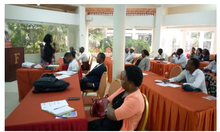
CIDI conducting a dialogue meeting with stakeholders.

CIDI continued promoting community advocacy for improved responsiveness by the WASH duty bearers in advocacy for reduced water tariffs, quality and affordable WASH services in Kampala, in the 3 divisions of Nakawa, Lubaga and kawempe. This was however under restricted work environment due to covid19 national guidelines on limited public gatherings. Nonetheless several engagements were realised with Kampala City Division Councils on the WASH policies, legal framework & guidelines including the planning and budgeting processes/cycle of KCCA. This project was being funded with support from the Democratic Governance Facility-DGF. The project ended and is due for renew in 2021.