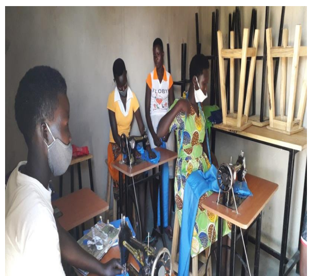
The teenage mothers during training on tailoring skills at the learning centre.