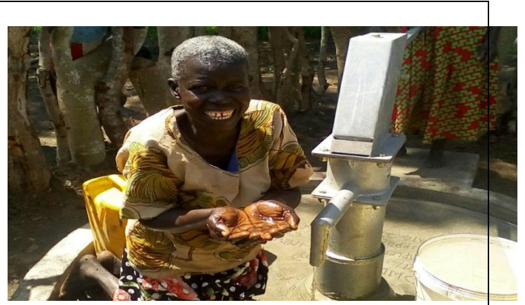
Photo showing an old woman enjoying safe water access at a drilled borehole by CIDI in Olingoi india, Katakwi district.